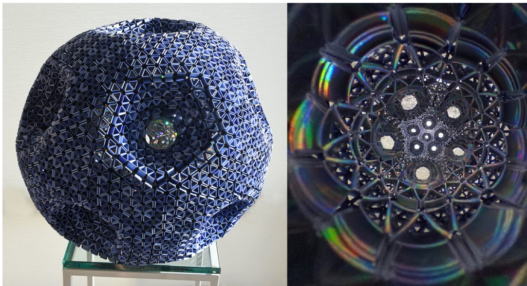
Figure 1. Big Boy Blue (2020), snapology origami sculpture of an eleven-holed torus from by David Honda. The left part shows an outside view of the sculpture while the right part shows a spherical image taken from the inside.

registration fees and travel costs, in particular for international conferences. Thus, only the online format of the event enabled David’s participation.