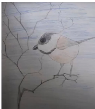
(a) “Black-capped chickadee” (2019), graphite, watercolour on paper by child of eight years. The tree is clearly following a Y-grammar construction.