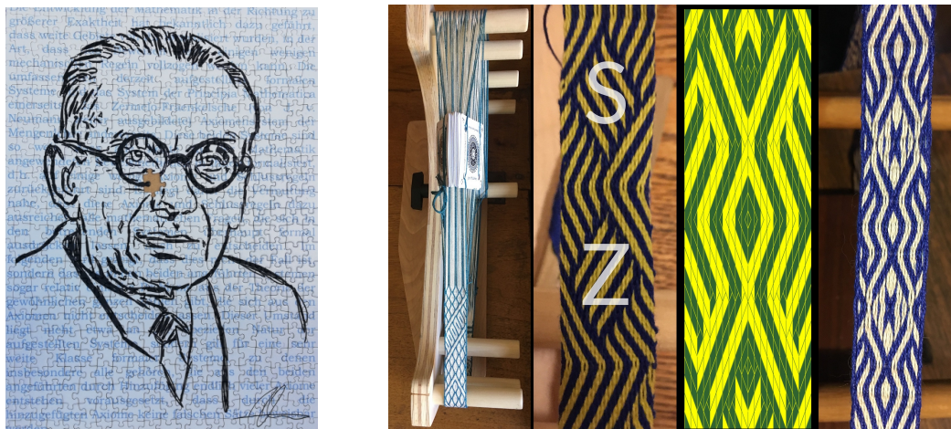
(a) “Incompleteness” (2018), digitised drawing on a jigsaw puzzle by Demian Nahuel Goos. Alluding to Kurt Gödel’s famous incompleteness theorem, a piece of the puzzle is missing deliberately.