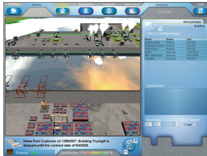
Figure 1: The SimPort Interface

Besides limiting the amount of visible variables, the buttons representing the commands in the game are fairly large and limited in amount. To give players extra information a tool tip was added to every button.