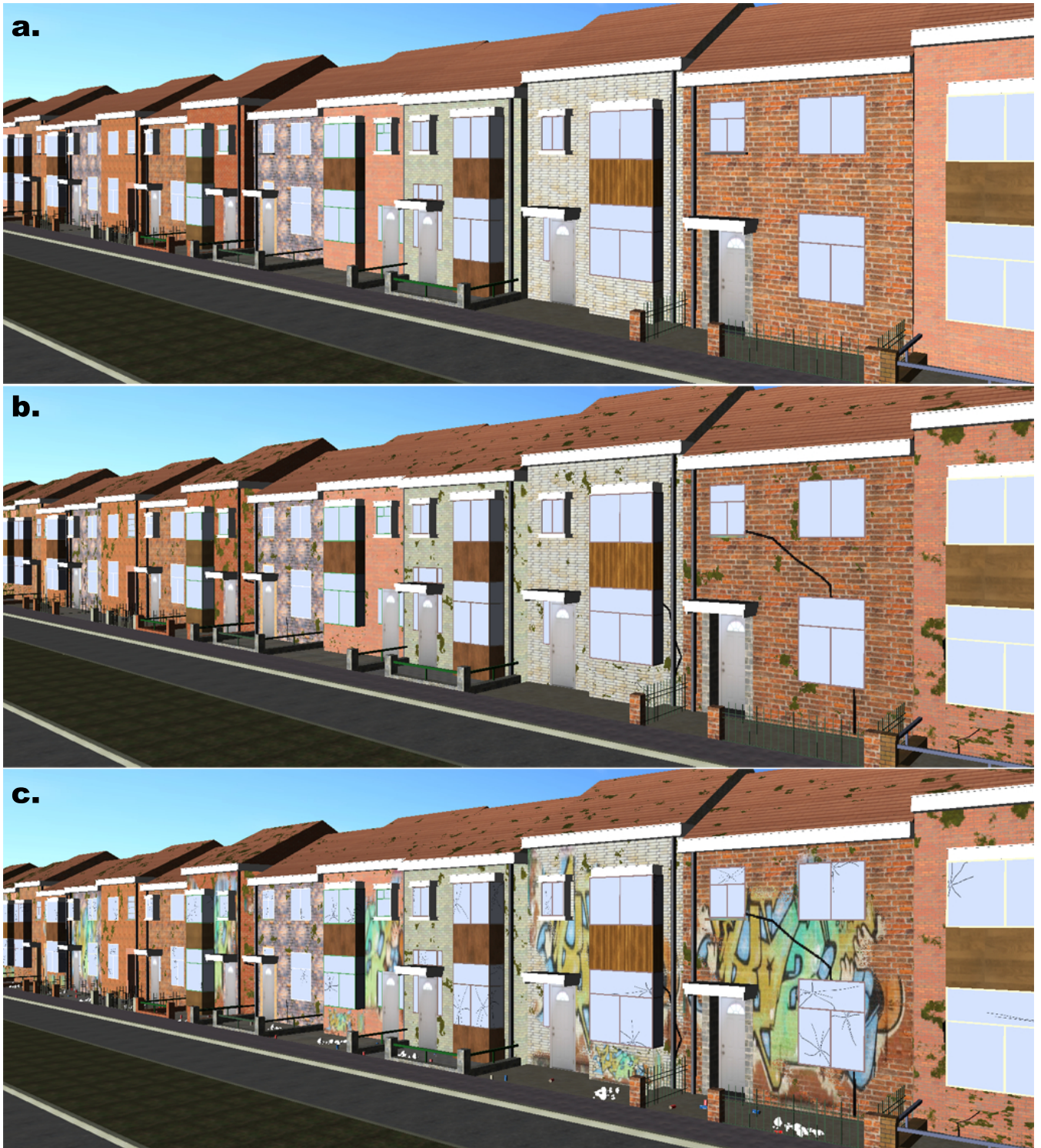
Figure 4: The same street but in various conditions: a) all houses are new and intact (no filter applied), b) the same houses have different ages, achieved using filters that add moss on the walls and roof, cracks in the walls and rust on the drain pipes, c) the same street, but with a high vandalism filter that uses additional sub-filters to produce smashed-in windows, graffiti and garbage.