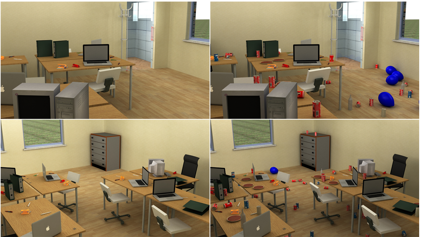
Figure 5: On the left, two views from an office are shown. To the right, we see the same scenes, but with a party filter applied to them: some balloons, empty bottles and cans are spread around the room, a few cakes are placed on the desks, and the desks and computers have been slightly rotated to give a more messy effect.

used as the threshold value: in the pixel shader, we use the roof texture when the corresponding grayscale value in the noise texture is above the threshold and the moss texture when below the threshold. In other words: the higher the threshold, and thus the higher the age of the building, the more moss will be visible.