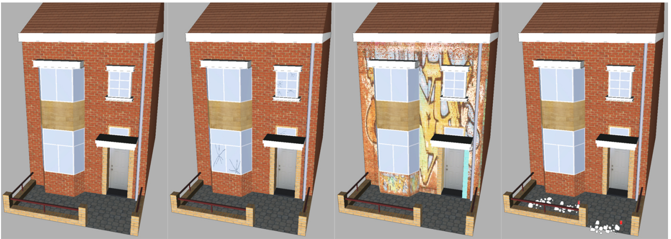
Figure 3: Four versions of the same house: (from left to right) the first one is not filtered, the second has some cracked windows, the third one has graffiti on the walls and the fourth one has rubbish in the front porch.

three input nodes: the input scene, the number of garbage items and a random seed; and one output node: the resulting scene. The input nodes are passed along to an instruction that places instances of a class (in this case the rubbish class) in the scene.