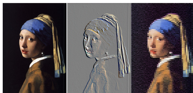
Figure 1: The painting Girl with a pearl earring , by Delft painter Johannes Vermeer; from left to right: original photo, with an emboss filter applied, and with a patchwork filter applied.

PCGames 2011, June 28, Bordeaux, France Copyright 2011 ACM 978-1-4503-0804-5/11/06 ...$10.00.