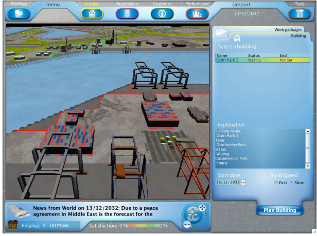
Figure 4. SimPort Game View

The framework makes it possible to develop more serious games, of a similar nature, in shorter time. SimPort is not limited at all to the port area in Rotterdam but other ports can also be played. Furthermore, the application is not browser-based anymore, and supports 3D graphics and GUI, while maintaining LAN and webbased networking.