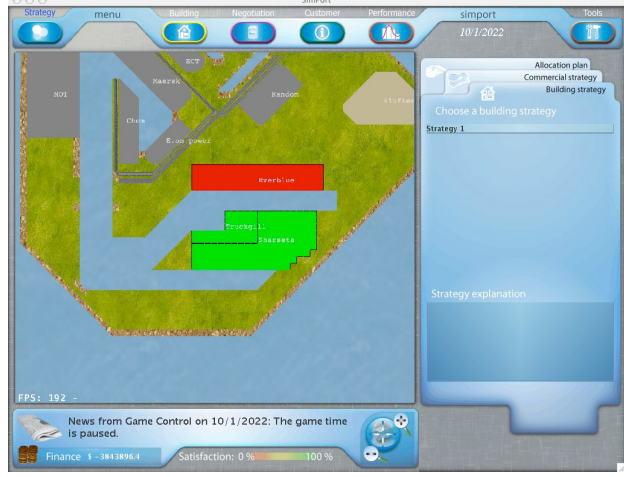
Figure 3. The Radar View

The current solution entails two views of the map. The first is an overview, as though the player was looking at a planning map. Company buildings and terrains area visible as outlined areas, with no structures visible. As the player comes closer, the view changes to something resembling a satellite view. The texture of the terrains becomes visible, as does the water, but still no buildings are visible.